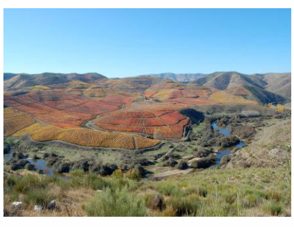
QUINTA DE ERVAMOIRA

13% Alcohol content Total Acidity 5.8 g/l tartaric acid 3.12 pH