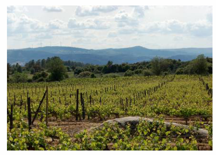
QUINTA DOS BONS ARES